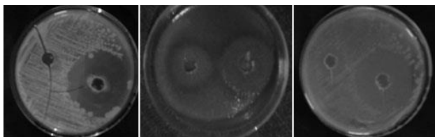
Figure 4. Zone of inhibition of Aspergillus fumigatus against Staphylococcus aureus , Streptococcus pyogenes and Pseudomonas aeruginosa .

From the above Table 1. It shows that only Aspergillus fumigatus showing degree of bacterial inhibition to the tested organisms ( Streptococcus pyogenes , Staphylococcus aureus and Pseudomonas aeruginosa ) which indicate that only Aspergillus fumigatus have pharmacological activities. Other fungi like Aspergillus flavus , Aspergillus niger , Rhizopus and Penicillium do not