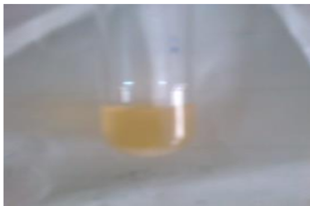
Figure 1. Alkaloid test

In tannins test blue color for Gallic tannins or green dark for catholic tannins was not found in Aspergillus fumigatus , Aspergillus flavus , Aspergillus niger , Rhizopus and Penicillium . It show that these creatures does not have pharmacological activities (inhibition of carcinogenesis, host-mediated antitumor activity, antiviral activity. Subsequently the compounds are recognized to be neutral compounds which don't respond with any corrosive or base