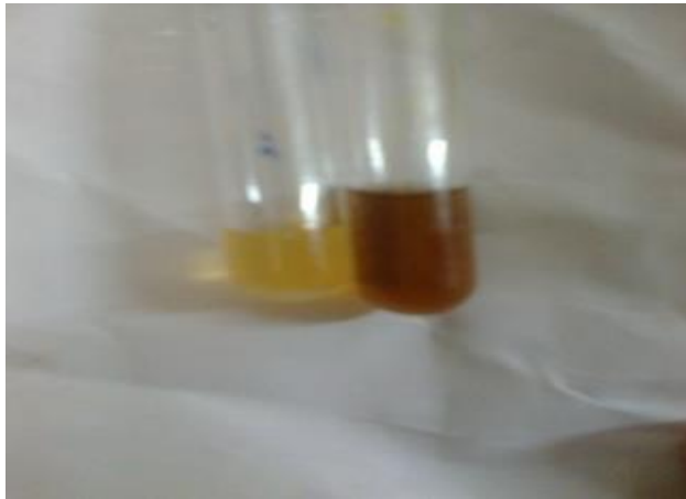
Figure 2. Tannins test