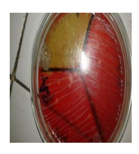
Fig 3: Alpha & Gamma Hemolysis On Blood Agar