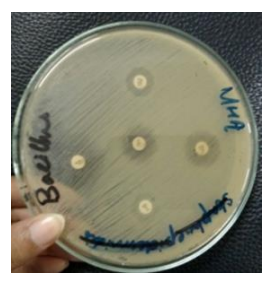
Fig 5: Antibiotic Susceptibility Test